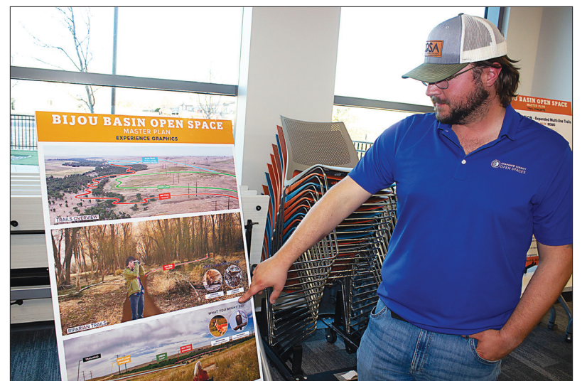
This map of the Bijou Basin presents its location in relation to I-70 Corridor communities — south of Byers and west of Deer Trail.